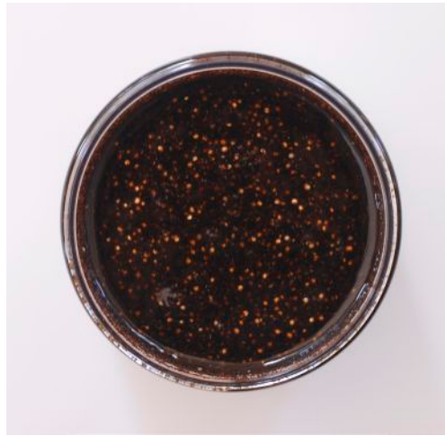
Kapha Body Exfoliating Paste coffee • cardamom • blood orange

Kapha skin stays in balance and clear when cleansed, hydrated & nourished with stimulating & detoxifying ingredients found in our Kapha range of skin & body care.